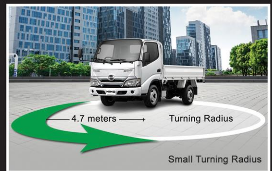
4.7 meters Turning Radius