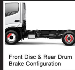
Front Disc & Rear Drum Brake Configuration