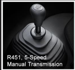
R451, 5-Speed Manual Transmission