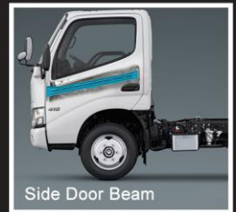
Side Door Beam