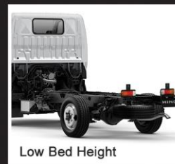
Low Bed Height

A lower bed design makes it easier to load and unload cargo.